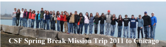
CSF Spring Break Mission Trip 2011 to Chicago

CSF is a gathering for students who are seeking to follow Christ together in genuine community. As a community, we hope to encourage thoughtful exploration of what it means to be a follower of Christ in a complex and divisive world. We embrace conversations that are open and respectful, ideas that are true to who God is and who we are in God, and lifestyles that show following Christ is a way of life, not just a system of belief. We know the journey is enhanced by companions and friends and therefore seek to build genuine relationships among all who come. Regardless of background or tradition, all are welcome to join this fellowship as we journey together in the lifelong commitment of following Christ.